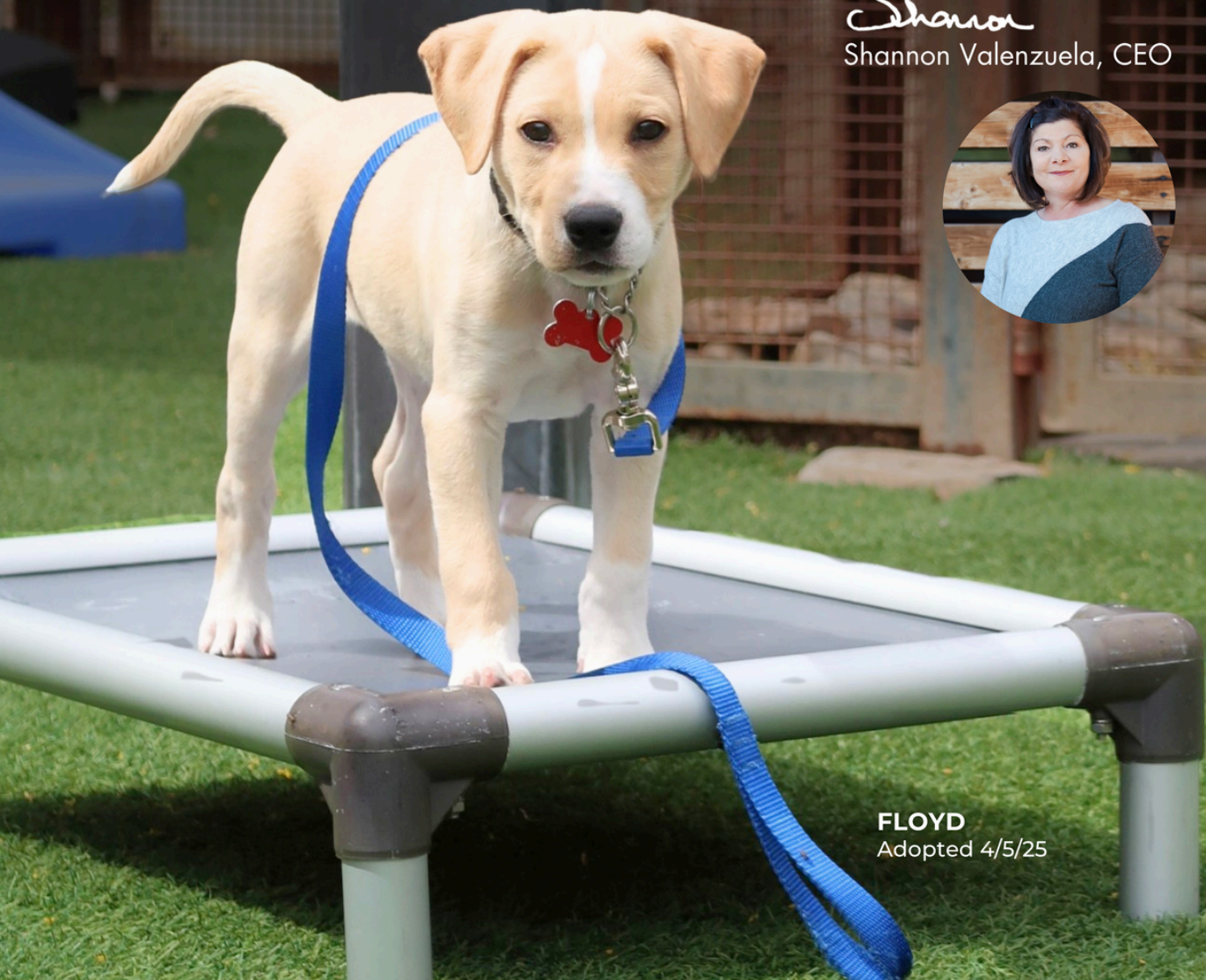
FLOYD Adopted 4/5/25