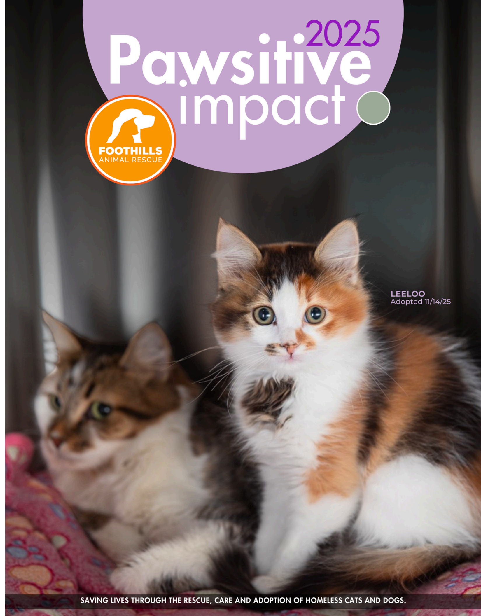
LEELOO Adopted 11/14/25

SAVING LIVES THROUGH THE RESCUE, CARE AND ADOPTION OF HOMELESS CATS AND DOGS.